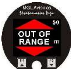
Outside of max range for AgLaser unit