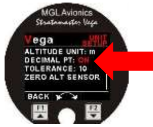
Choose your display precision