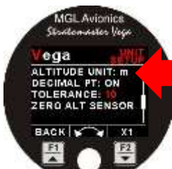
Select units of measure

The AgLaser is designed to provide accurate, reliable altitude data in either meters or feet. To select your desired unit of measure, follow the steps below.