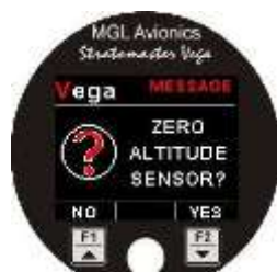
Switch to wheels-to-ground height

If left in the initial condition that an AgLaser unit is received in, the Vega display will give a precise measurement of the exact height of the laser module, wherever it has been installed in the plane. This means that left as-is and installed in the wing of a plane, the unit will give you a reading of your wing-to-ground height at any given time. Users also have the option to recalibrate this data to give precise wheels-to-ground height instead by zeroing out the initial value while the plane is on the ground using the process below.