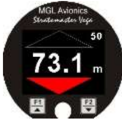
Too High – Descend!