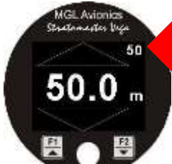
Select a target altitude

Your target altitude is the exact center of the altitude range that you are looking to fly in. As an example, if your parameters are from 40m to 60m, set your target altitude to 50m.