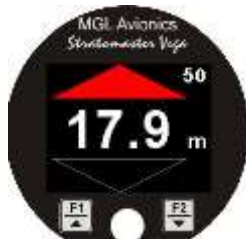
Too Low – Pull Up!