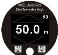
In Tolerance – Good!