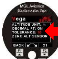
Create your altitude range

Once you have established your target altitude, you need to establish your altitude tolerance. This value determines the size of the altitude window that you can fly in without triggering an indication from your Vega display. To use our earlier example, if you want to maintain an altitude of 40m-60m, you would set your target altitude as 50m, and then use the steps below to adjust your altitude tolerance to +/- 10m.